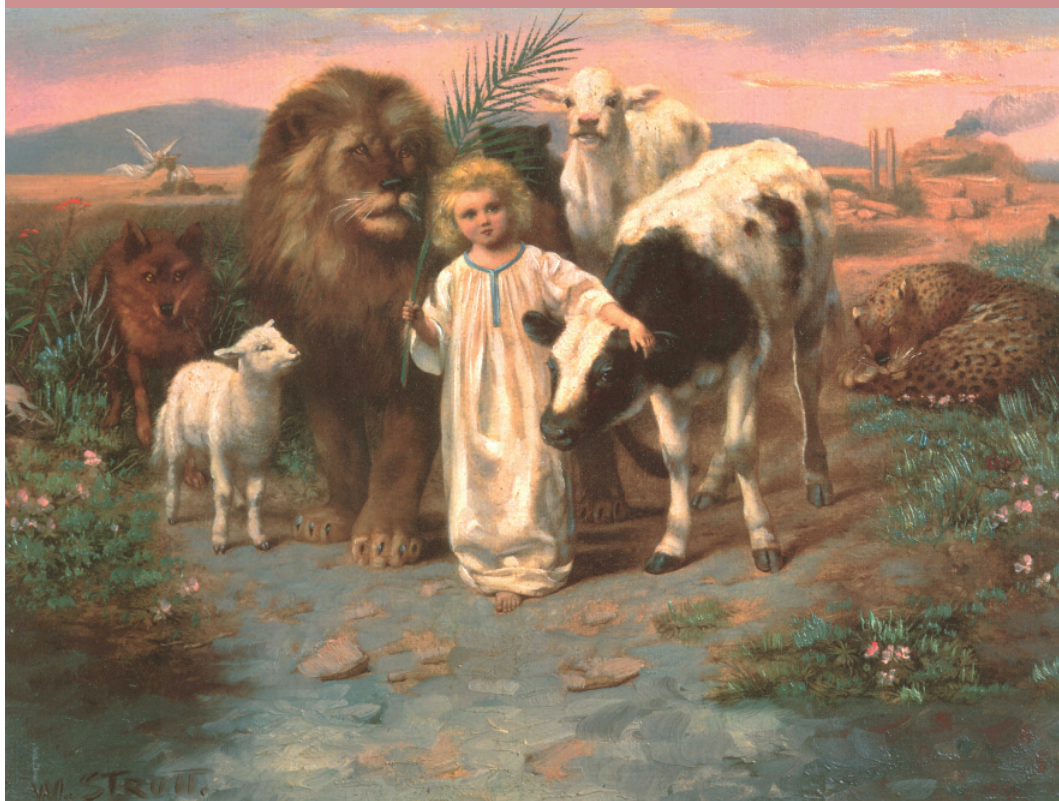
Peace by William Strutt