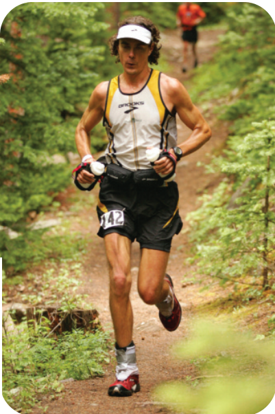
Vegan ultramarathon champion Scott Jurek and other top athletes credit their plant-based diets. See ScottJurek.com .

In Genesis 2:15, God instructed Adam to “till” and “keep” the Garden of Eden, and we may see caring for God’s Creation as our sacred task. Humanity’s appetite for flesh is depleting essential land, water, and energy resources. Further, worldwide livestock production contributes up to 51% of humanity’s greenhouse gasses. 11 The most important thing people can do to reduce their contribution to environmental damage is to reduce their use of animal products.